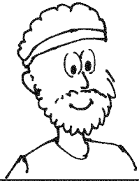
Meet John the Baptist.

Fill in the blanks with the words from this list.